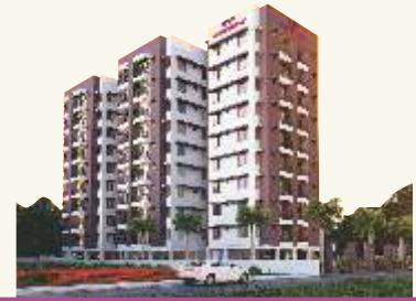
Willow NEAR FAROOK COLLEGE, CALICUT