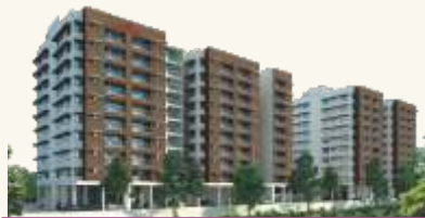
FreeSia COMPACT APARTMENTS KAKKANAD, KOCHI