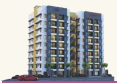
Daffodils Akkulam, Trivandrum