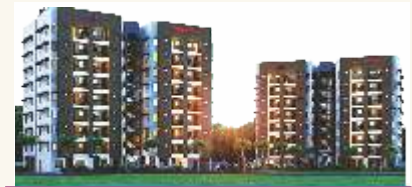
Gardenia Near Isthapark, Cochin

Disclaimer : This brochure is purely conceptual and does not constitute a legal offering. The promoters/developers reserve the right to alter/delete/add specifications mentioned herein.