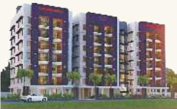
Aster Near Jubilee Mission Hospital Chelakkottukara, Thrissur