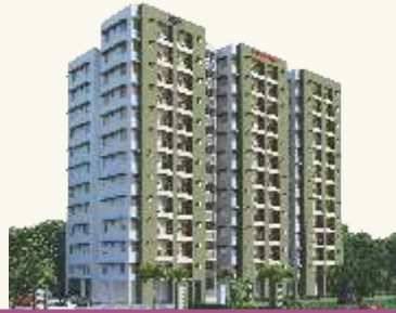
Bilberry PALLIPURAM, TRIVANDRUM