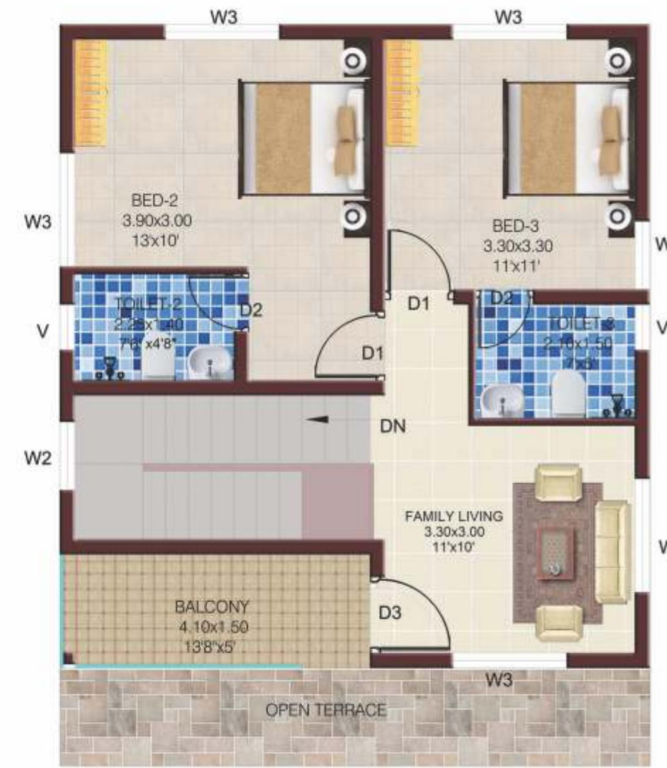
Type 2 First Floor