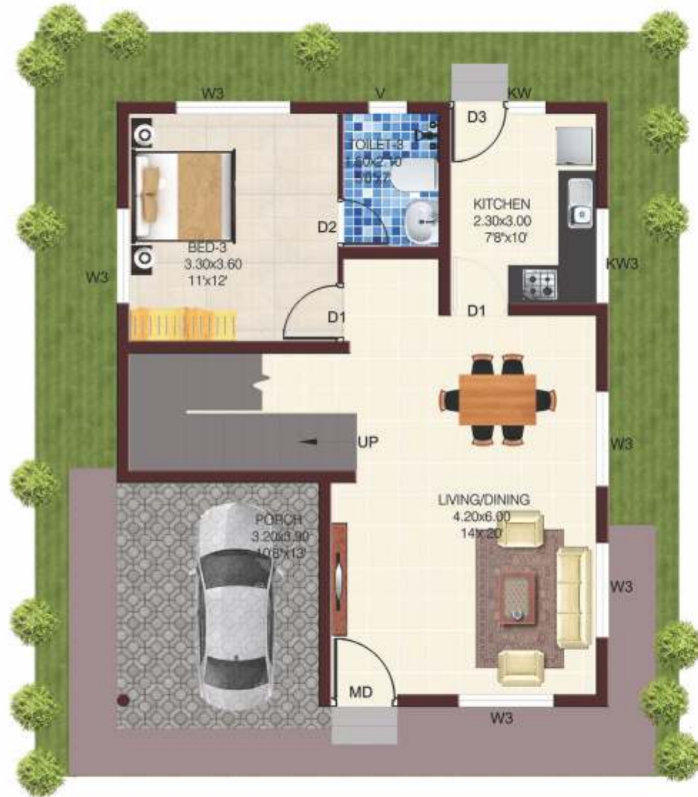
Type 1 Ground Floor