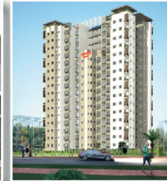
CONFIDENT SYMPHONY Near Pulinchodu Metro Station Kochi