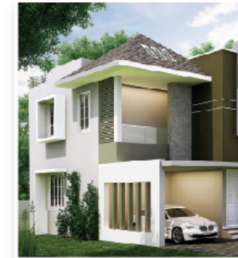
CONFIDENT AMBER Near Info Park, Kochi