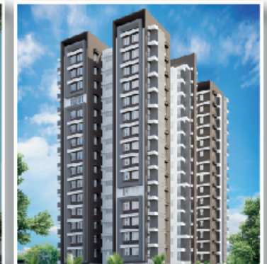
CONFIDENT IRIS Near Info Park, Kochi