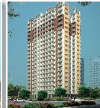
CONFIDENT PRIDE Near Lulu Mall, Kochi