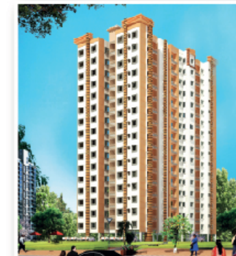
CONFIDENT LEO Near Info Park, Kochi