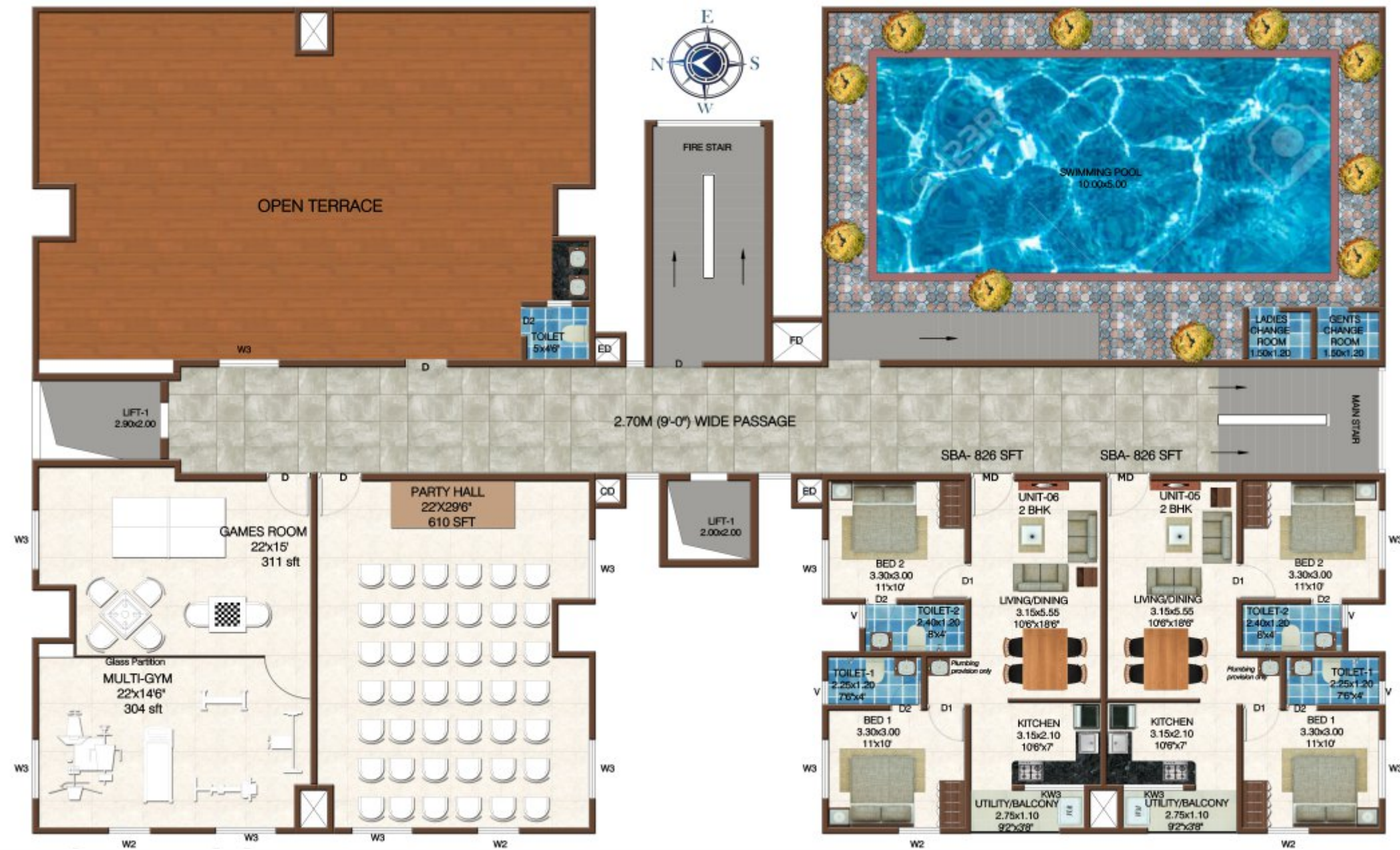
12th Floor Plan