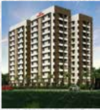
CYGNUS Kottayam K-RERA/PRJ/049/2020