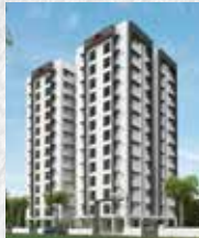
JOINVILLE Kochi K-RERA/PRJ/327/2020