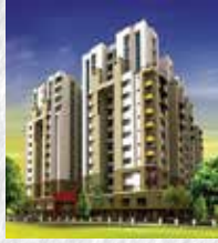
EXOTICA Calicut K-RERA/PRJ/141/2020