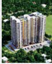
LOTUS Thrissur K-RERA/PRJ/016/2020