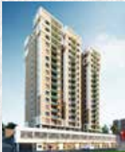
GREENWICH Calicut K-RERA/PRJ/287/2020