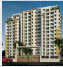
CROWN Trivandrum K-RERA/PRJ/018/2020