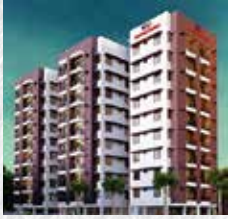
WILLOW Calicut K-RERA/PRJ/035/2020