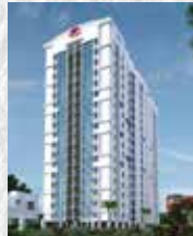
WHITE HOUSE Kochi K-RERA/PRJ/288/2020

READY TO OCCUPY PROJECTS IN TRIVANDRUM, KOCHI, THRISSUR & CALICUT.