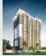
WHITE BERRY Kochi K-RERA/PRJ/130/2020