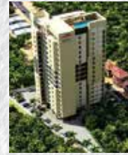
GREENFIELD Trivandrum K-RERA/PRJ/101/2020