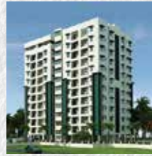
ZENITH Trivandrum K-RERA/PRJ/106/2020