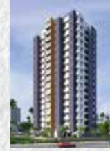
PINNACLE Kochi K-RERA/PRJ/102/2020