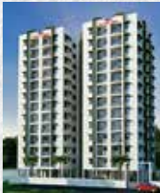
MAPLE Thrissur K-RERA/PRJ/224/2020