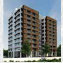
FRESIA Kochi K-RERA/PRJ/104/2020