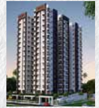
PRIME III Trivandrum K-RERA/PRJ/174/2020