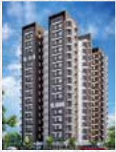
IRIS Kochi K-RERA/PRJ/025/2020